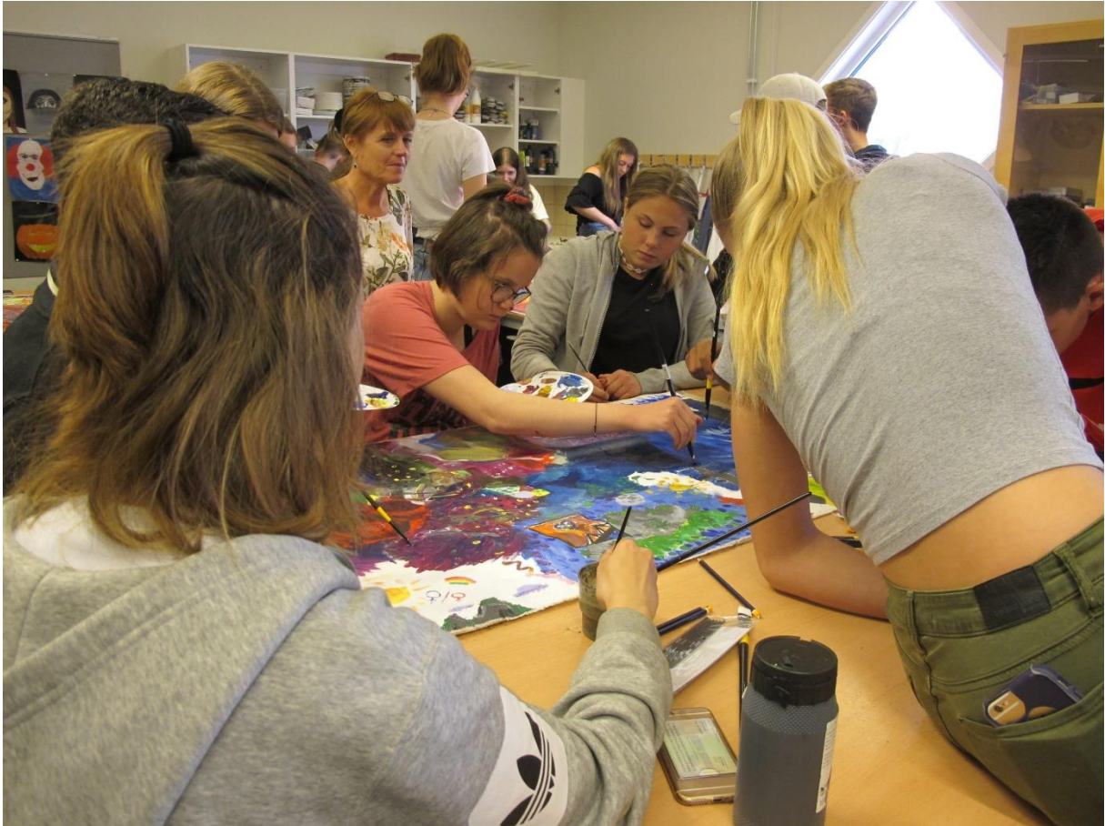
And here comes the final results 😊